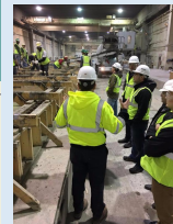
Shockey Plant Tour